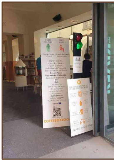
Some coffee houses sure make it very graphic! A traffic light and 6ft signs! But not everyone is willing to comply. Just like in France, large scale peaceful protests are taking place in most Italian cities.