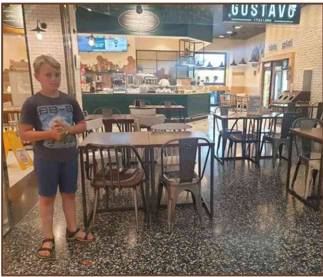
No green pass - no sitting! We used to enjoy our time at this nice coffee shop with the kids