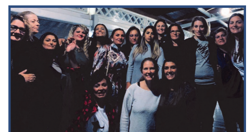
Women's Ministry Outing

Whether its on the streets or a cell group, marriage counseling or men's prayer meeting on the mountain at midnight we are sowing and watering and pruning and serving and pausing and watching in awe at what God does. Thank you for your prayers as we serve our Lord together.