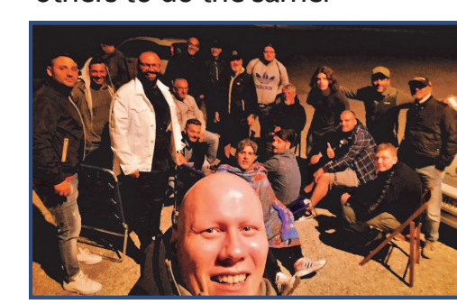
Men's Midnight Prayer on the Mountain

There has been a sense of revival in the air the past few years, and we are regularly seeing people set free from every type of chain. Our focus is apostolic: 2 Timothy 2:2 Outreach, discipleship, and trying to teach others to do the same.