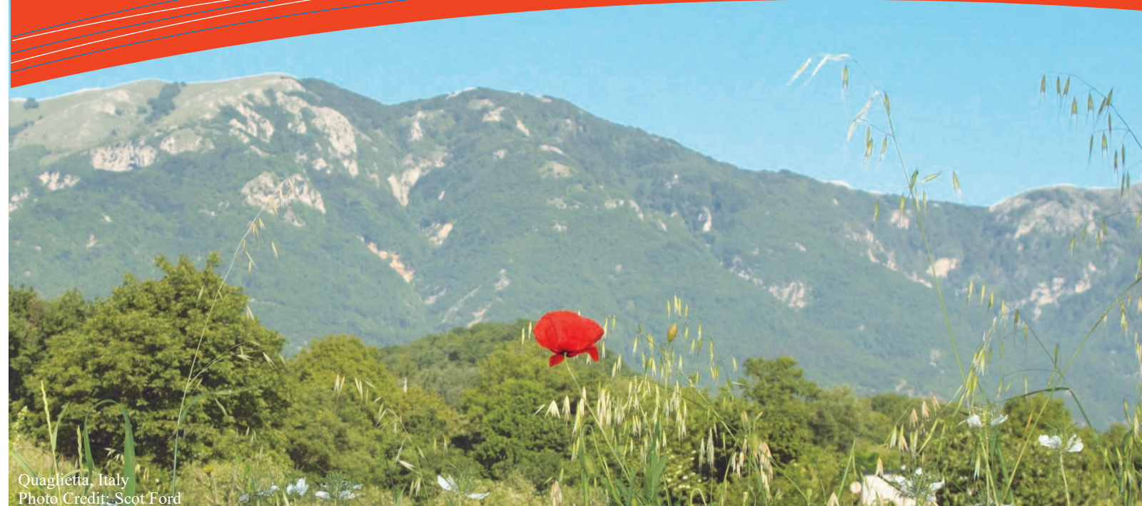
Quaglietta, Italy

World Outreach Center is recognized as a 501(c)(3) organization by the IRS, and as such is able to receive tax-deductible donations.