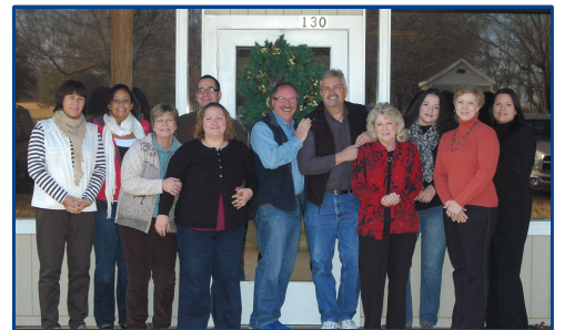
2010 WOC Missions Interns

We took in a great group of interns from September - December 2010, and put them through the paces which included classes, local outreaches, and trips to Mexico and Washington DC. It was a fruitful time with a great reception wherever we went. During this time, our prayer intensive birthed something we never expected - a new initiative to Heidelberg, Germany (a sister city to Karlsruhe 35 minutes from our missionaries.). The prophetic word declared - "what starts in Heidelberg will spread through Germany and more."