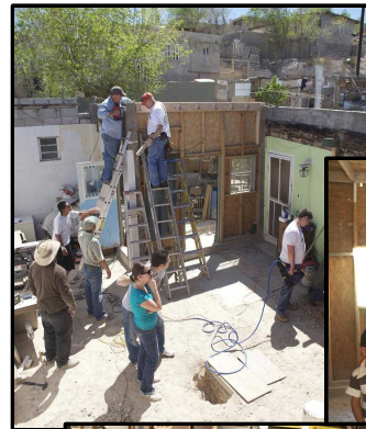
Before and after at the Comodore (Orphanage /Feeding Ministry)