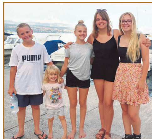
Our 5 beautiful children

We are exceedingly grateful to God, WOC, and all our financial supporters and friends around the world who play such valuable role in these projects. ➔