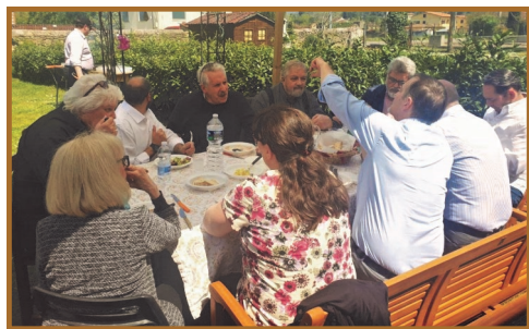
Sharing life around the table

One of our greatest joys is hosting people and dinner parties to introduce others to the savior. In Italy, some of the most important life discussions happen around the table!